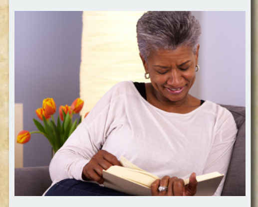
Bible Study SBC Bible Study will resume in the Fall (September)

Join by phone: 650.779.0279 PIN: 205.702.116#